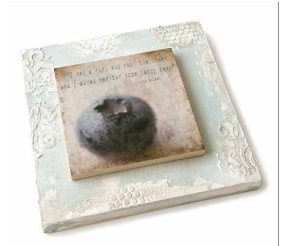
8" x 8"

This photo art tile was inspired by summer in years gone by — fresh blueberries, singing “American Pie,” and laughing with friends. Happiness and creative ideas are often found in life’s simple joys. ➔